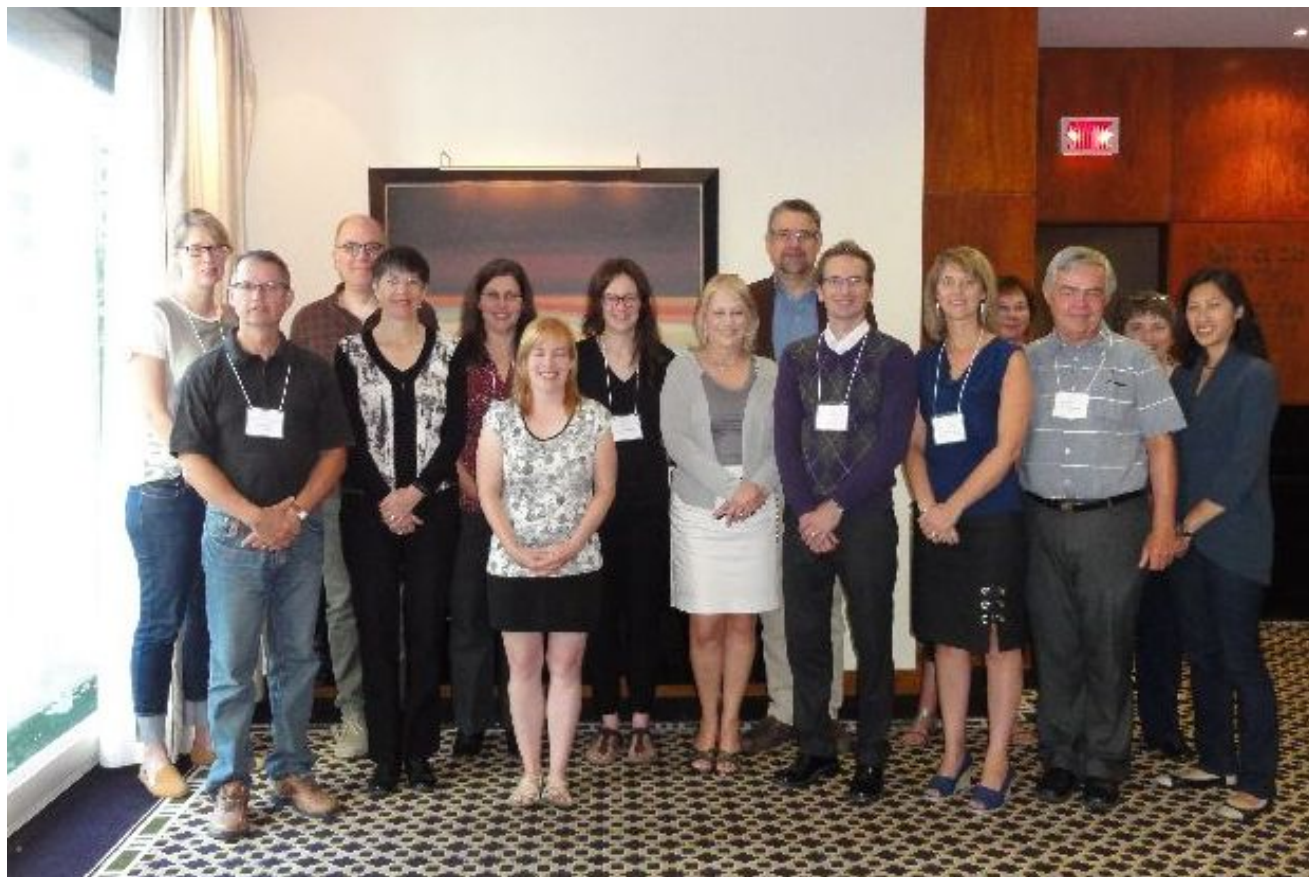
Participants in the 2014 PEPLN Initiation Workshop