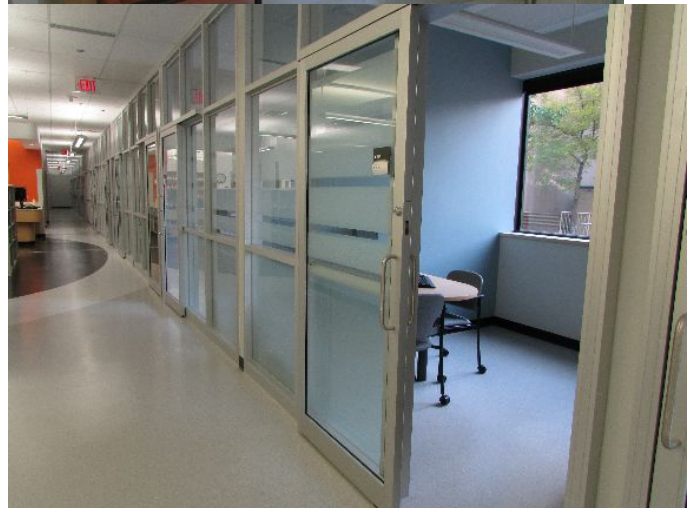
Photos of the new Pharmacy Skills Lab