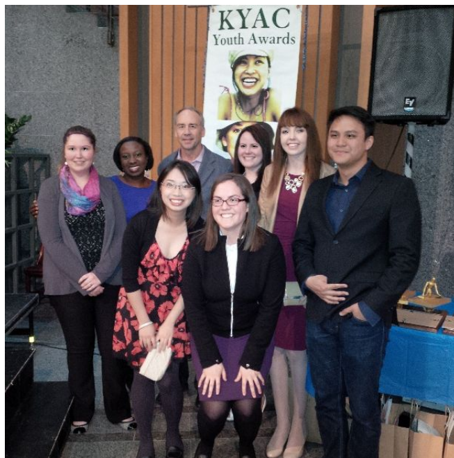
Photo : Graduate and undergraduate students from the School were recognized for their volunteer contributions to the local community

were recently recognized by the city of Kitchener for the efforts.