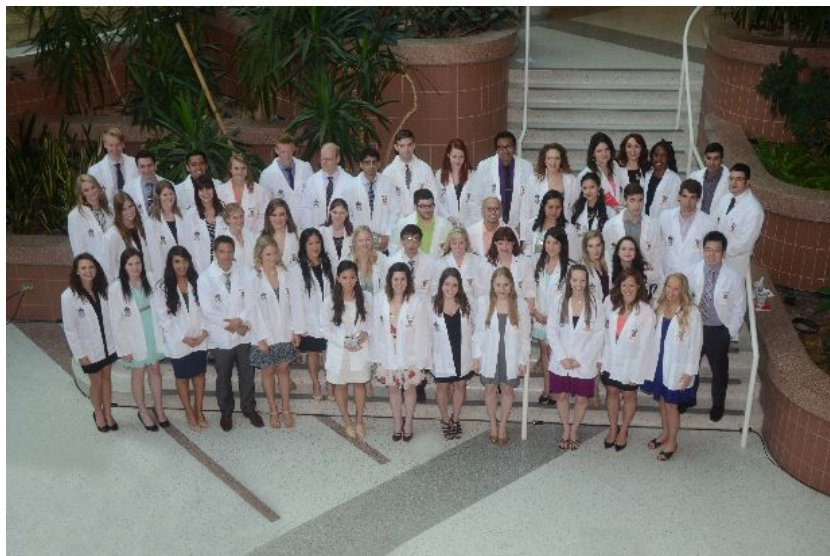
Photo : The Class of 2014 in their personalized White Coats

On June 5 th we held our Welcome to the Profession Ceremony that awarded Bachelor of Science (Pharmacy) degrees to 50 students.