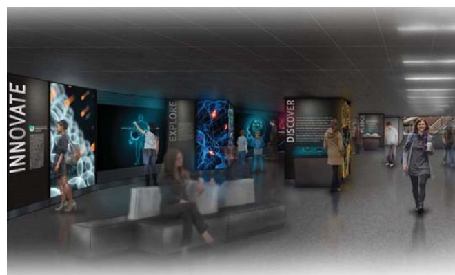
Story of Medicines design concept rendering.

On November 22, 2011, the Faculty of Pharmaceutical Sciences at UBC hosted a special event to unveil design concepts for The Story of Medicines. An interactive exhibition experience like no other, The Story of Medicines is a hands-on interpretive exhibition that tells the story of pharmacy through multiple perspectives. To view the presentation click here. ( http://www.pharmacy.ubc.ca/aboutus/building-information/som )