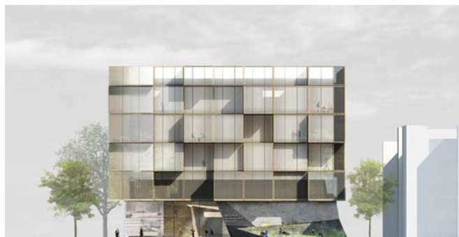
Architectural rendering of the new UBC Faculty of Pharmaceutical Sciences Building. Image courtesy Saucier + Perrotte Architectes and Hughes Condon Marler Architects (HCMA)

We are honoured that our new building has been recognized with such a distinguished award and congratulate Saucier + Perrotte Architectes and Hughes Condon Marler Architects (HCMA) for their joint design accomplishment. To read the full award citation, or learn more about the Canadian Architect Awards of Excellence, click on the following website: ( http://www.canadianarchitect.com/Awards/UBC.aspx )