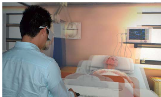
KAVE demo participant practices reading a virtual patient chart

Live demonstrations of the 3D Keele Active Virtual Environment (KAVE) were held from November 2-4. The KAVE provided immersive and interactive simulations of patient practice settings. This year the Faculty also took the opportunity to showcase education research projects through a Poster Session on November 3. The session generated a lot of interest and exposure for education research on curricular integration and problem-based learning being conducted within the Faculty.