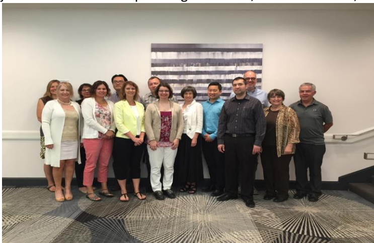
Participants in the 2016 Pharmacy Educator Informatics Network Workshop

Peer Leaders met for a project initiation workshop on August 22 - 24, 2016 in Toronto, Ontario.