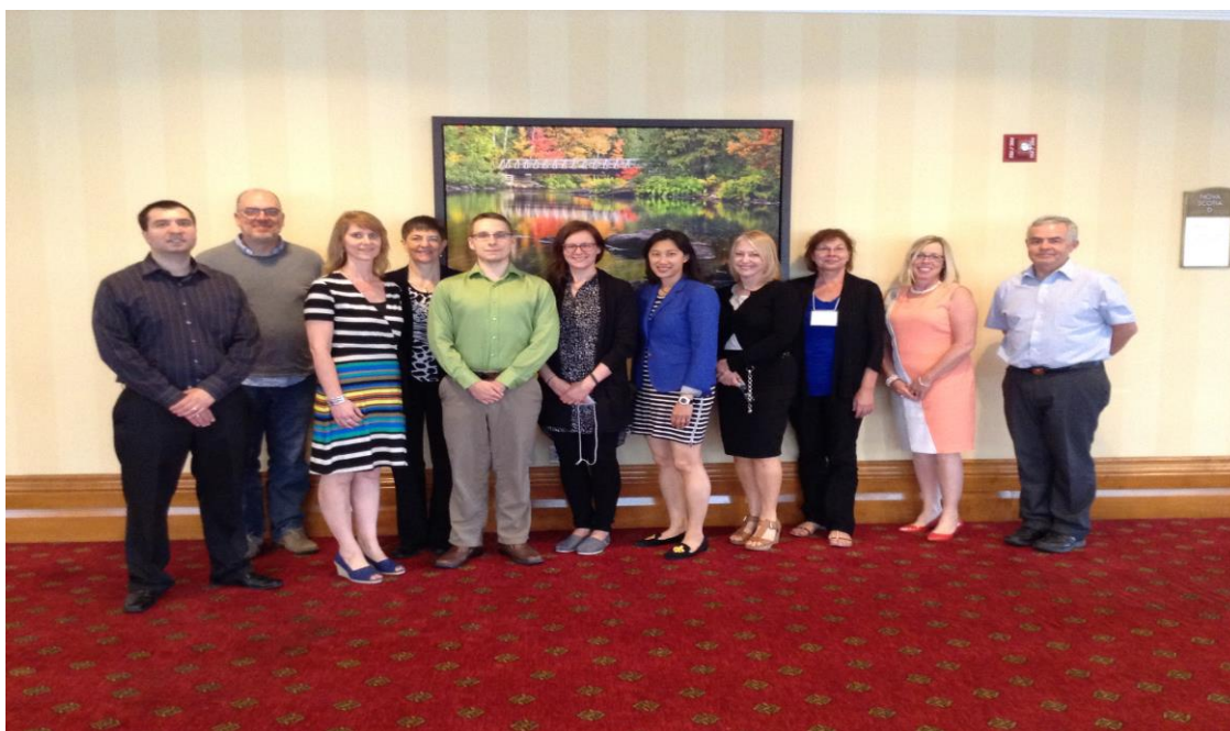
Participants in the 2015 PEPLN Knowledge Transfer Workshop