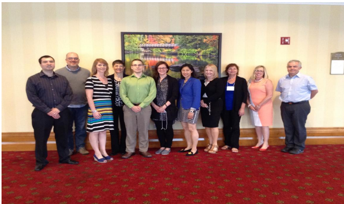
Participants in the 2015 PEPLN Knowledge Transfer Workshop