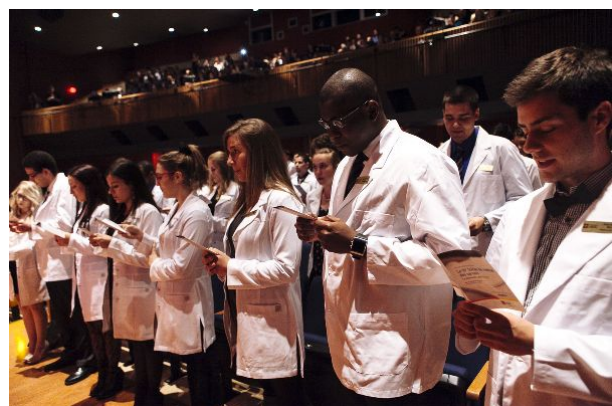
White Coat Ceremony.