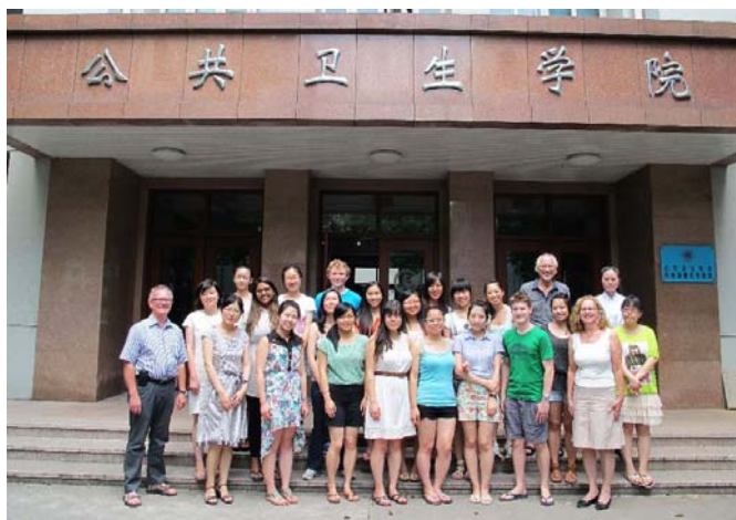
Int D 457 China Collaboration - July 2013 Class picture, taken at Fudan University

The partnership with China has resulted in an Interdisciplinary course for pharmacy and medical students from the U of A and public health students from Fudan University in Shanghai. The field trips in collaboration with Shanghai Municipal Health Bureau and the Shanghai University of Traditional Chinese