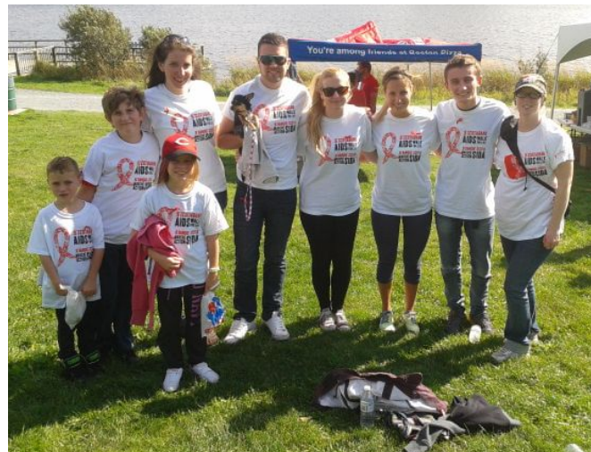
Students and supporters from Memorial’s School of Pharmacy participate in the AIDS Walk for Life on Sept. 22

Committee of Newfoundland and Labrador (ACNL) provide essential services to people who are living with and affected by HIV/AIDS. Proceeds from the walk support a number of ACNL projects as well as education and outreach initiatives.