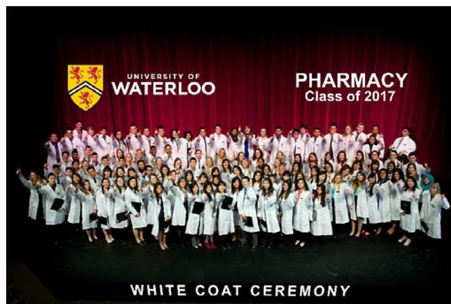
The School of Pharmacy welcomed its first class of PharmD students at the White Coat ceremony on Thursday, January 9, 2014. The Rx2017 class has 120 students.

http://uwaterloo.ca/pharmacy/experiential-co-op-and-pharmd-clinical-rotations/pharmd-rotations