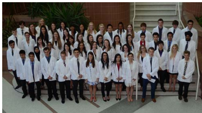
The Faculty of Pharmacy Class of 2017 at the White Coat Ceremony

On September 30 th , 2013 the Faculty of Pharmacy welcomed 55 new students to the undergraduate program at the annual White Coat Ceremony. These students will make up the class of 2017 and were presented with a white coat from our programs' alumni. This event coincided with our annual Homecoming and the opportunity to involve alumni as drapers during the ceremony was fantastic. Student awards and bursaries were handed out, as well as special recognition for preceptors to our students.