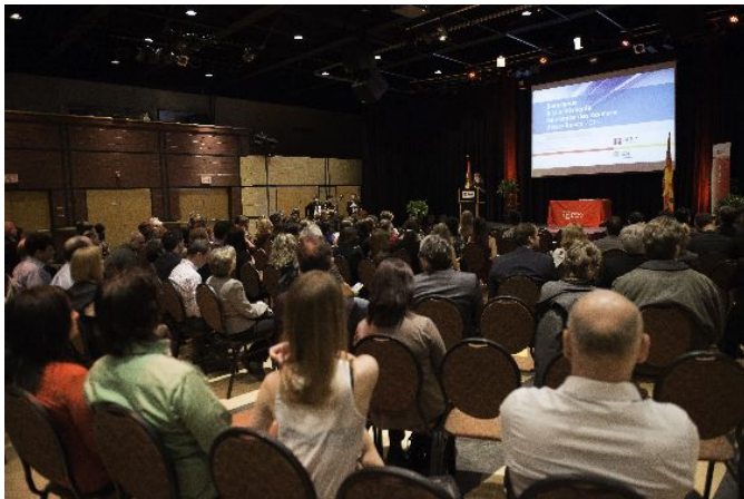
Scholarships Ceremony.

The Scholarship Ceremony Faculty of Pharmacy is an annual event, which aims to reward academic excellence and involvement of our students. In addition to the faculty representatives, partners and major scholarship donors are there to celebrate the achievements of our students. In 2013, the Faculty of Pharmacy awarded 93 scholarships to students whose excellence deserves to be rewarded and highlighted. The total amount of scholarships was $62,900.