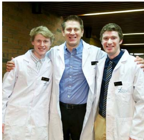
Members of the Rx2016 class at the reception following the White Coat Ceremony

Thank you to Loblaw for sponsoring this entertaining competition.