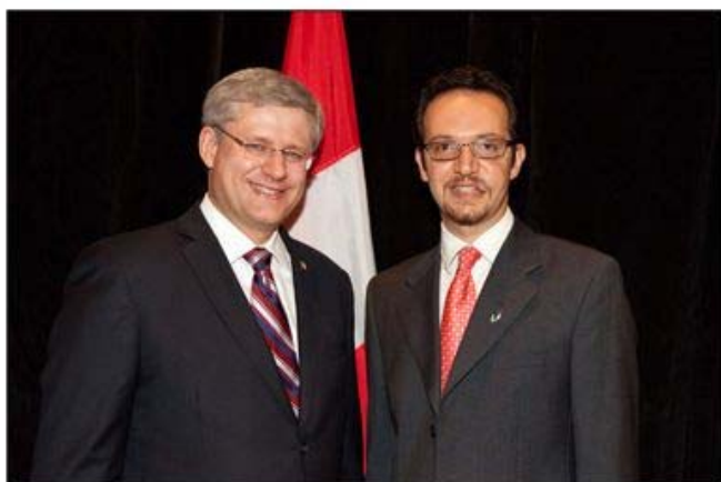
Office of the Provost University of Toronto